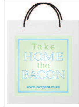
Special Offer - Campaign Bags Available