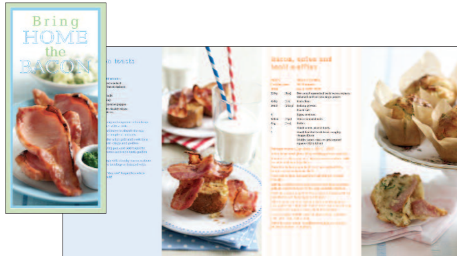
12 page leaflet 210 x 99mm