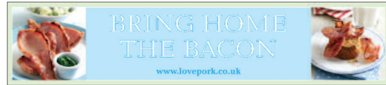
Window vinyl 91 x 490mm