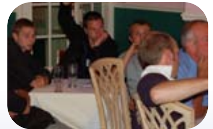
Dent Ltd staff taking part in the interactive BPEX workshop