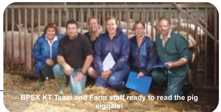
BPEX KT Team and Farm staff ready to read the pig signals!