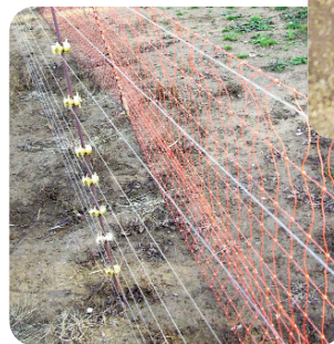
Having initially spaced the two fences 40 cm apart, the gap was increased to 1m to prevent the wind blowing the net onto the other fence.