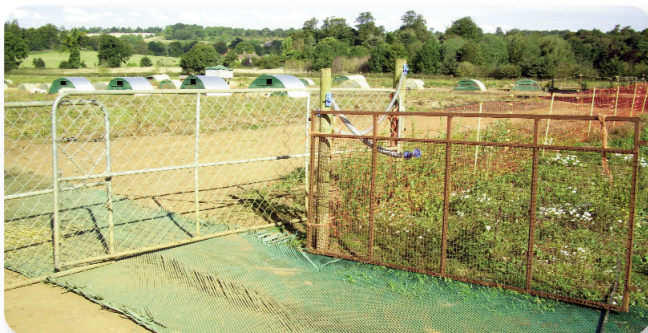
Matting reduces the formation of ruts in gateways