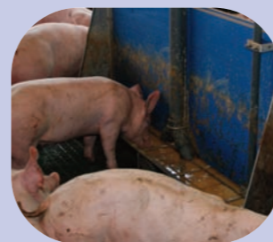
Wet Feeding Forum