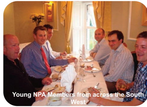
Young NPA Members from across the South West